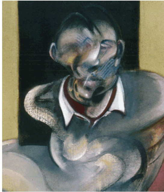
Francis Bacon's Study for self-portrait (detail) 1976

So, what is the wonderful reconciling, exonerating and thus rehabilitating, truthful biological explanation of our species' extremely competitive, aggressive, angry, selfish, greedy, materialistic, escapist, artificial, superficial, alienated—in fact, deeply psychologically distressed and lonely—human condition that brings about the long dreamed-of liberation from that terrible state and the complete TRANSFORMATION of the human race?