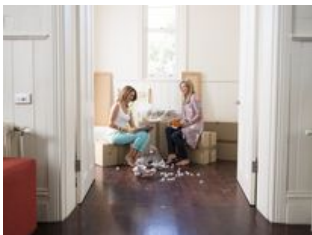
Want to move with less stress? SPONSORED