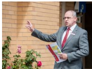
Using auction results to buy smarter SPONSORED