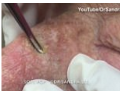
Pimple porn: Dermatologist becomes viral YouTube star