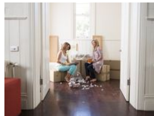
How to move with less stress SPONSORED