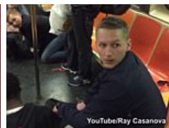
'Not heroes, just tourists': Swedish cops stop subway...