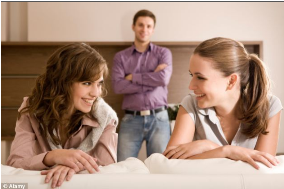
It has been claimed that women speak about 20,000 words a day - 13,000 more than the average man - and scientists say a higher amount of the Foxp2 protein is the reason women are more chatty

It has been claimed previously that women speak about 20,000 words a day - some 13,000 more than the average man.