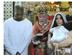
PICTURE EXCLUSIVE: Proud parents Kim Kardashian and Kanye West look on as North is baptised in a traditional Armenian ceremony in Jerusalem